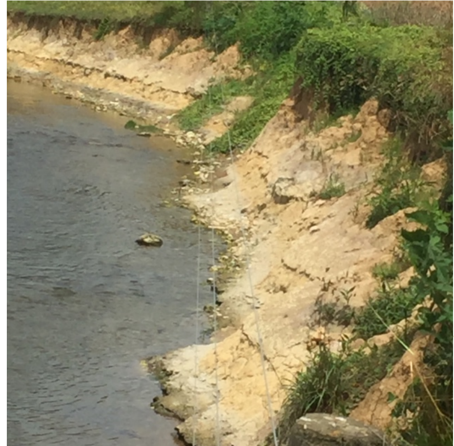
patrick / Climbers Run