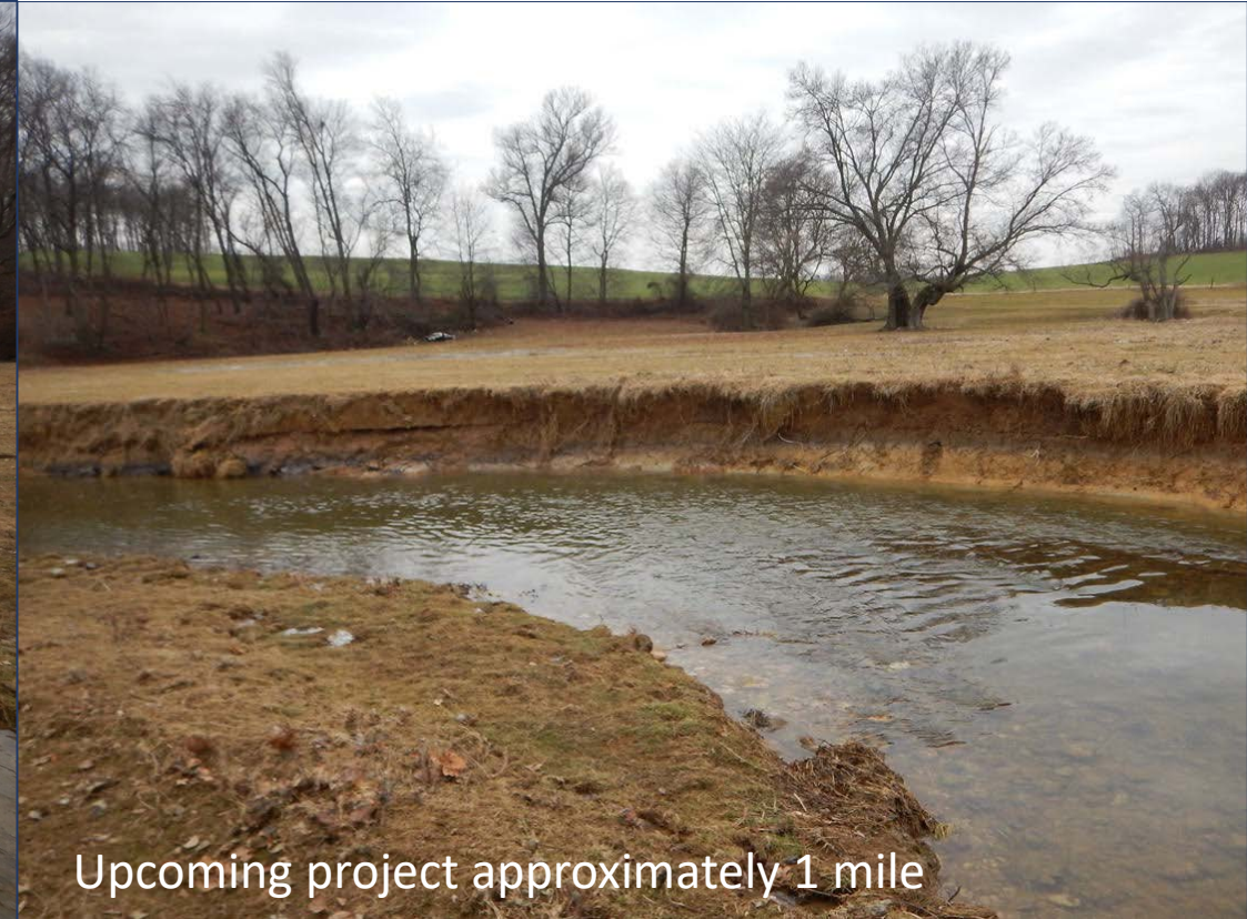
Upcoming project approximately 1 mile

Conowingo Creek Watershed: Eroded and steep banks