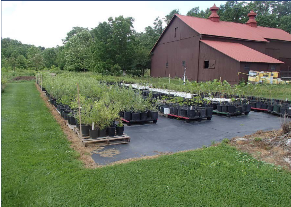
DTU Nursery: Sourcing & growing our own plants